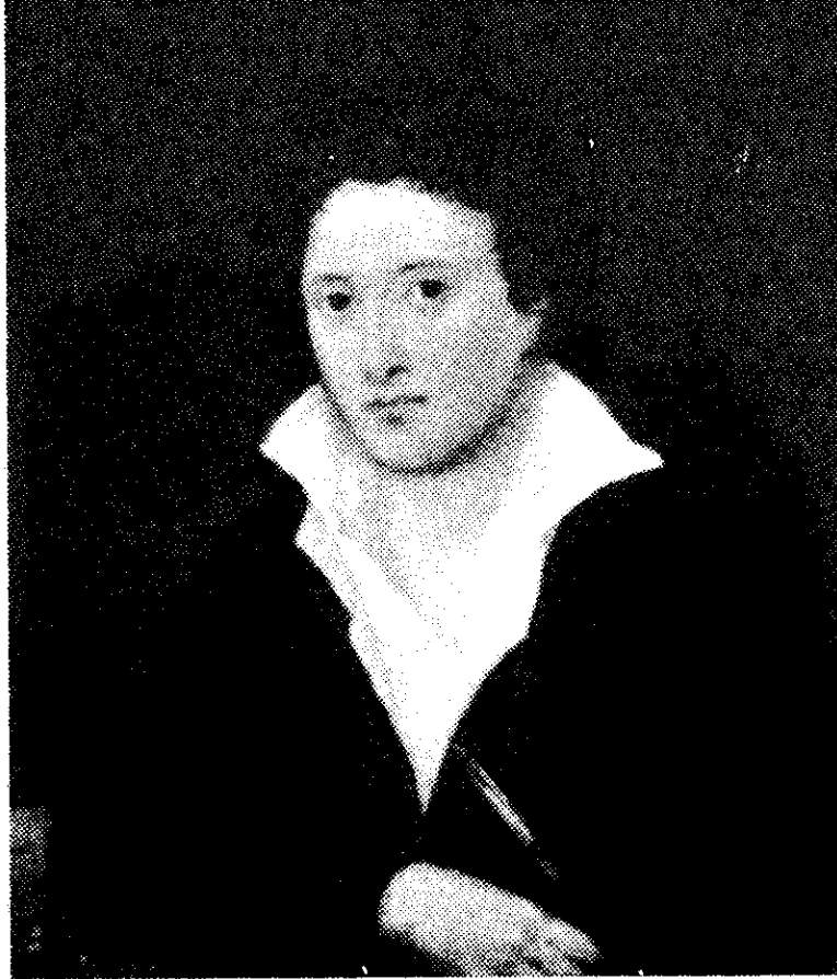
P.B. Shelley His "In Defence of Poetry" properly implies that socialist revolution would be unlikely today without an accompanying intellectual renaissance of the kind being initiated by the Labor Committees.

often high-school "drop-outs" — into their potential as a working-class intelligentsia. Although the benefits realized so far are merely preliminary, what has been accomplished already suffices to demonstrate what we have now begun the rapid spread of exactly that intellectual renaissance essential to socialist transformation during the period immediately ahead. This series of reports has thus begun to account for the origin of those secondary features of the Labor Committees which have already inspired terror among certain North American and European Communist Party leaderships, and have evoked awed reaction from such other circles as the AFL-CIO bureaucracy, the Urban Coalition, and the New York Times.