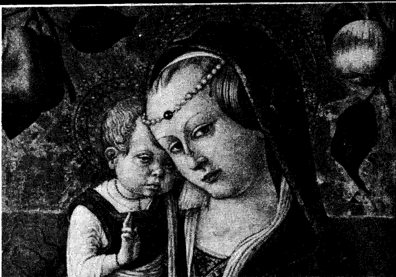
The Virgin Mary Behind the sadistic, psychotic smile, she knows the truth: she is the "Whore of Babylon," Satan herself.

such superstitious, alienated — i.e., "nationalistic" — fashion, he is overwhelmed by the seeming evidence of his "Southern inferiority."