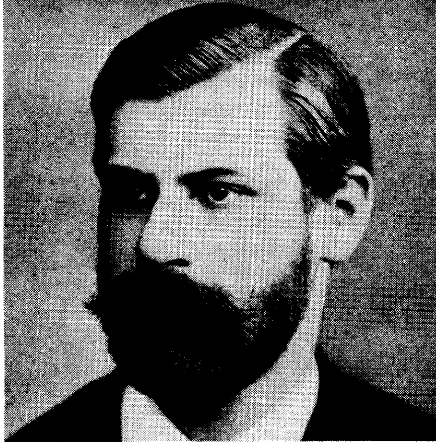
Sigmund Freud The influence of his "metapsychology" has remained an obstacle to the development of a scientific theory of mind by psychoanalysts.

As we have thus made psychoanalysis a branch of scientific anthropology, we have not only located it more efficiently within scientific knowledge in general, but have equipped psychoanalysis to become a self-conscious reflection of its own proper anthropological roots, to qualify it as a general epistemological tool of all scientific work rather than a limited therapeutic practice.