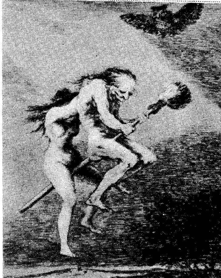
Witches They really exist: they are what most children (and later adults) unconsciously believe their own and other mothers to be.