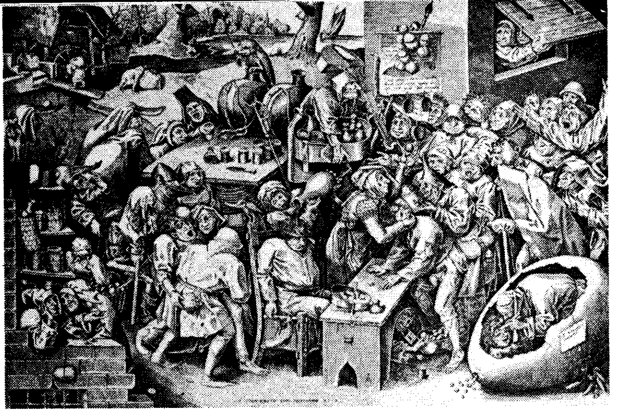
Peter Breughel's The Witch of Mallegem .

family; a broader area, the neighborhood; or, the region, or, the nation, or, the language or ethnic group, or, the commonality of a religious affiliation, etc. Similarly, the "logic" of events within each distinguished "area" and among "areas" are determined by the "rules" (axioms) implicit in the mother-dominated fantasy acquired in childhood.