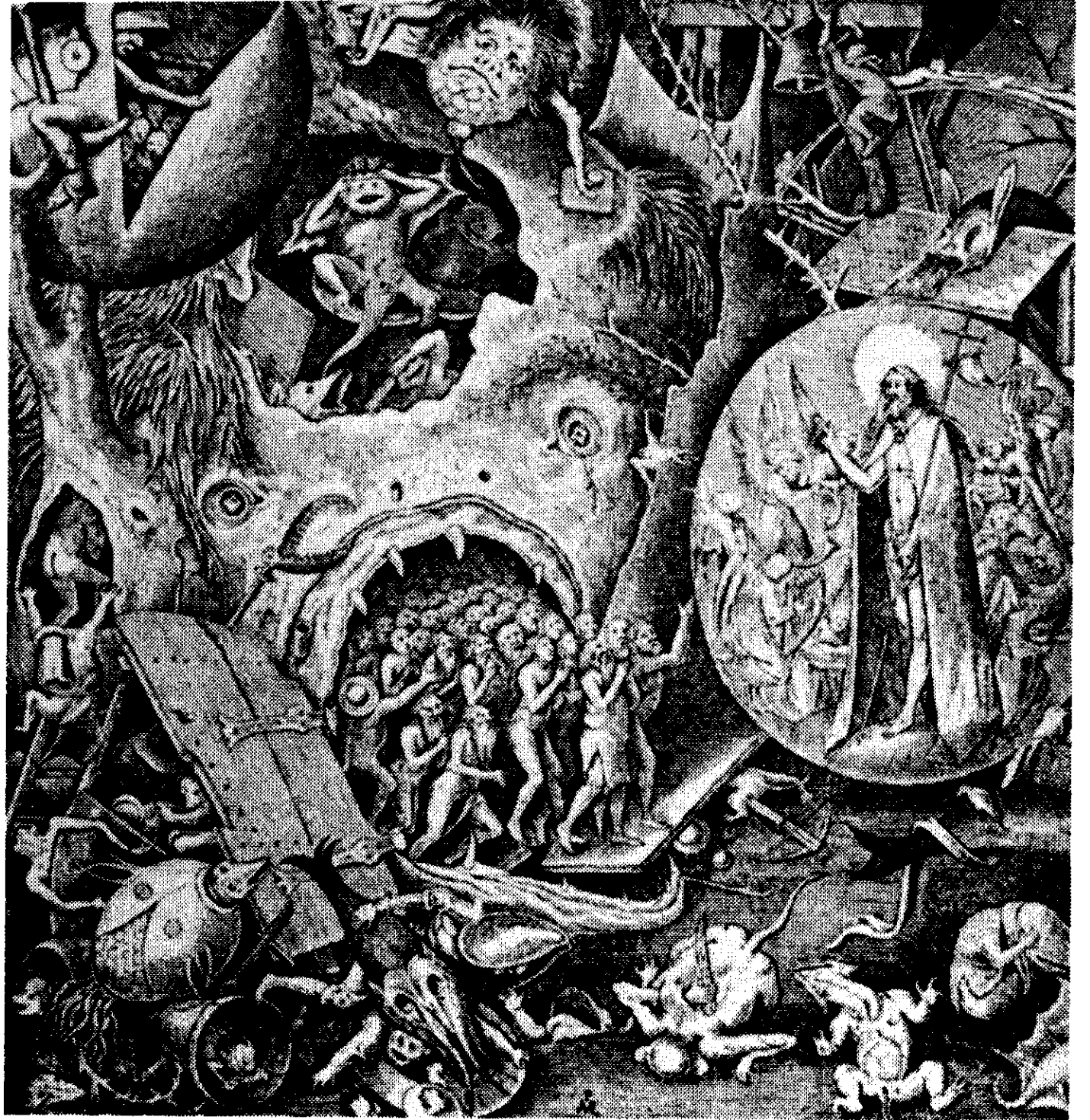
The companions of the infantile Ego, occasionally erupting to view from the "pit" of unconscious processes.

way, away from the sense of identity associated with dependency upon an internalized mother-image. Instead of saying, explicitly or (more significant) implicitly, "I am defined as a child of my parents who have predetermined my nature," the sane, adult individual defines his identity in a Spinozan way in the real world as a whole. His existing relationships to existing persons in general are the entirety of his identity. He has "grown up;" he is no longer an appendage of the internalized mother-image; his childhood has ended. He has given up the infantile "I," the Ego associated with the mother-image.